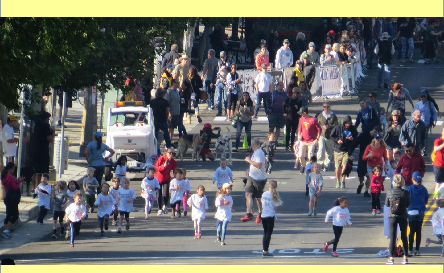
Little Kids Run to Highland