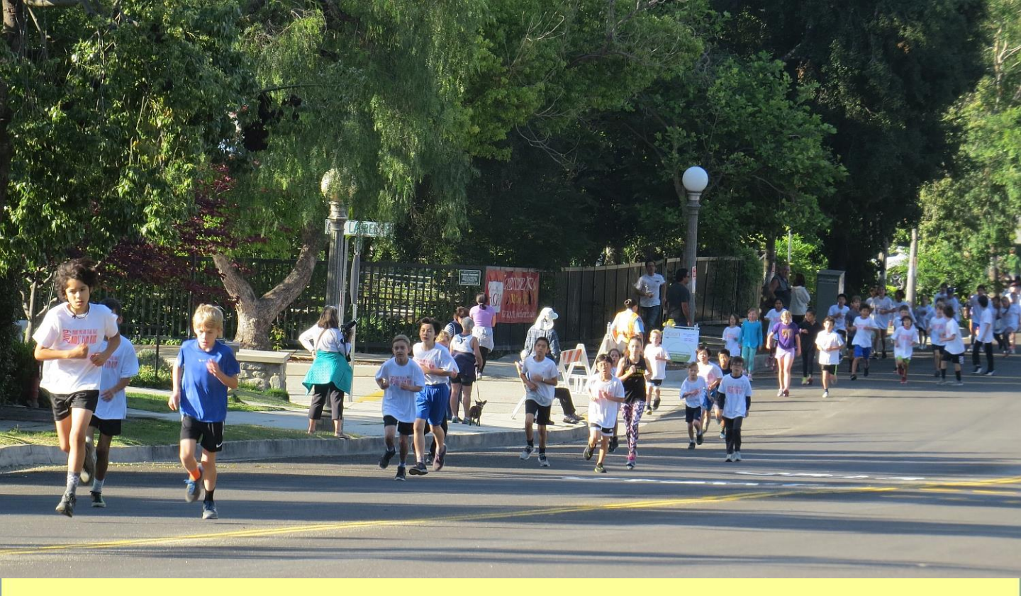
Kids Run to Mira Monte