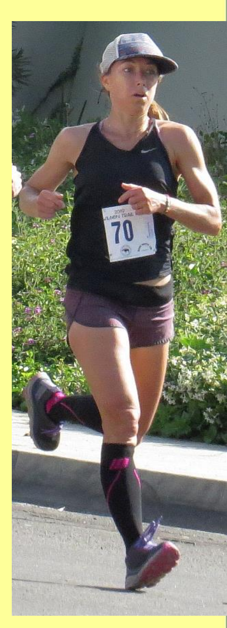
#1 #2 #3